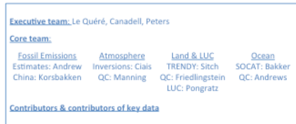
Figure 1. Overview of the organisation of the Global Carbon Budget 2017.