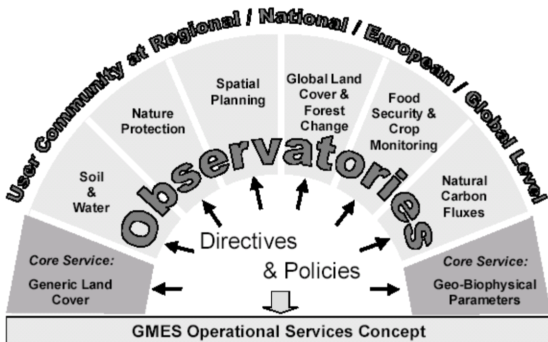
Figure 1. The geoland European project (2004-2007). The global monitoring for environment and security (GMES) activities of the European Commission (EC) and European Space Agency (ESA) is a joint effort to provide operational information by using available Earth observation resources and integrating them with existing models into pre-operational end-user applications. The geoland /Carbon (Natural carbon fluxes) observatory addresses one of the global vegetation monitoring priorities of GMES: assess carbon fluxes and stocks in the biosphere.

geoland combines 56 European service providers, research institutions, and user organisations. The broad range of "land applications" addressed by European Directives and Policies is treated by eight sub-projects (observatories) providing products and services addressing regional monitoring and reporting for nature protection, water and soil issues, spatial planning, and strategic information on food security and crop monitoring, global land cover and forest change, and natural carbon fluxes. The Earth observation data are 1)- processed by two core services (according to the observatories' requirements) and 2)- analysed by the observatories (addressing end-user needs).